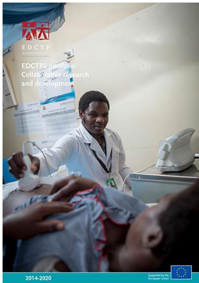
Collaborative clinical R&D online